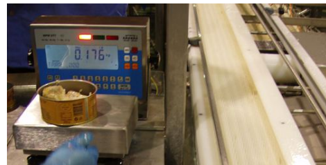
Instances of WPW/T/H/FH application in industry *

* Racks for scales do not come standard, and they are subject to individual valuations.