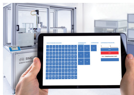
Option of remote mass comparator control via computer or tablet.

The mass comparator is equipped with top-class thermo-hygro-barometers allowing to test ambient conditions in real time and in different points (e.g. in weighing chamber, mass standard magazine, etc.). The characteristic feature of the device is high readability of pressure (0.001 hPa), humidity (0.01%), and temperature (0.001 ^{\circ} C).