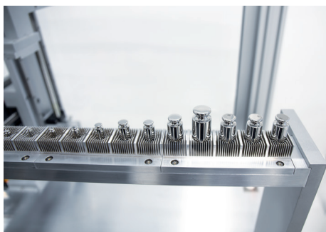
The RMC mass comparator is equipped with 100-position magazine.