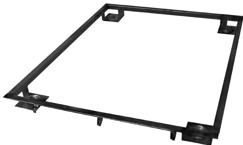
Frame for platform embedding

Embedding the weighing platform in the ground.