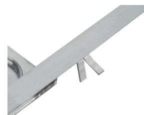
Element facilitating stable embedding of the frame