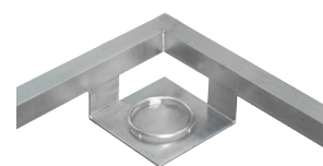
Supports facilitating embedding of the platform in the ground