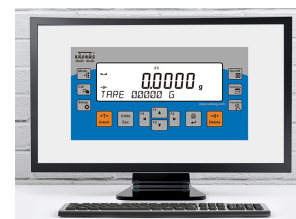
Weighing result window in R Panel software