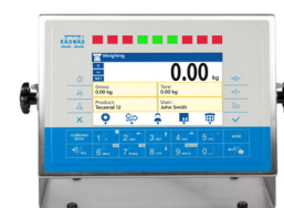
Bar graph is a graphic visualisation of current mass