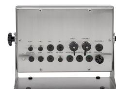
Easy access to communication interfaces