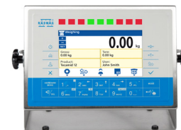
Bar graph is a graphic visualisation of current mass