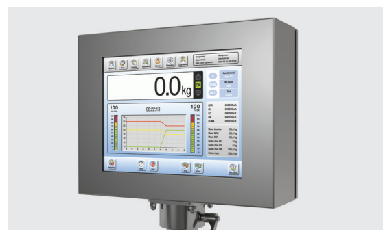
Indicator installed on an elevated rotary post.