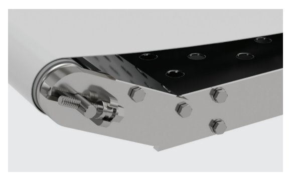
Conveyors disassembly requiring no tools.