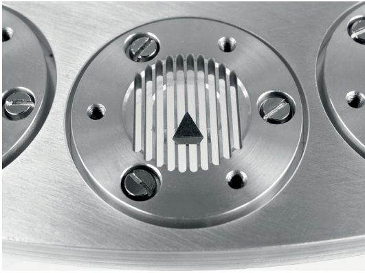
Comparison of very small 1 mg plate mass standards without the threat of jamming.

The mass comparator records all comparison reports and ambient conditions into databases. This makes them easily accessible and facilitates fast copying and printout.