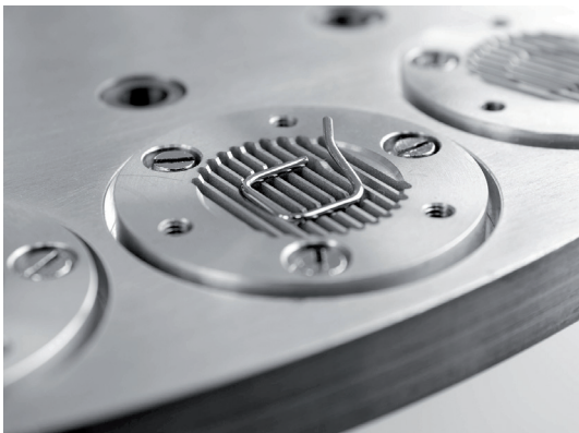
Custom design insert allowing calibration of rod mass standards.