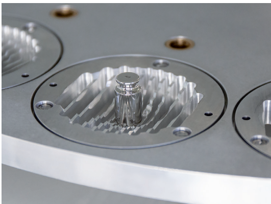
Universal insert for UMA-1000 guarantees precise measurement of 10 g - 1 kg mass standards regardless of shape and size.