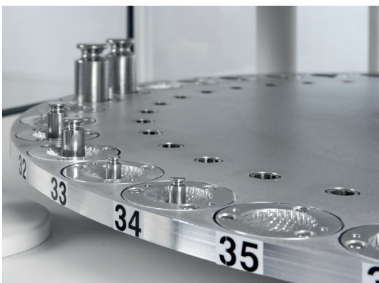
Possibility to load 36 objects onto the comparator's magazine. This allows to calibrate the whole set of weights during one course.