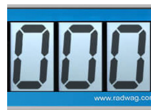
WWG-2/x - 6 digits of 11.2 cm height