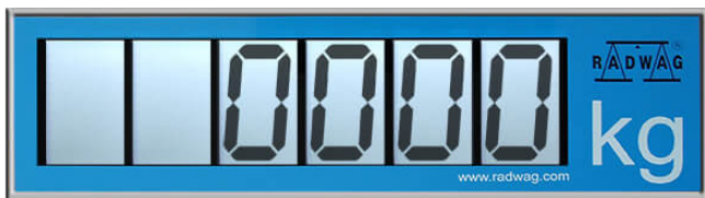
WWG-2/x - stainless steel housing