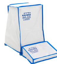
Fabric dust cover for AS 3Y