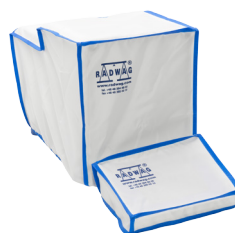
Fabric dust cover for XA 4Y