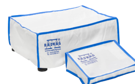
Fabric dust cover for PM