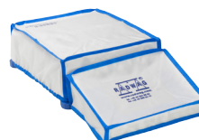
Fabric dust cover for PS 3Y