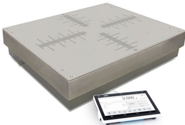
HRP 2000.5Y.KO Mass Comparator

More information on the website radwag.com/en/info,w1,ZE3