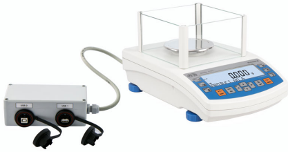
PS 1000.R2.H Precision Balance

More information on the website radwag.com/en/info,w1,X0B