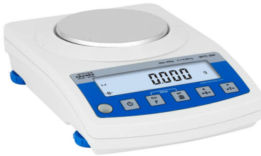
WTC 200 Precision Balance

The drawings, photos and graphics used are for illustrative purposes only.