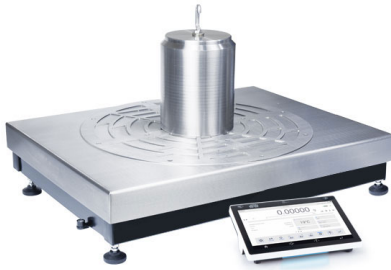
HRP 500.5Y.KO Mass Comparator

The drawings, photos and graphics used are for illustrative purposes only.