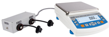
PS 6100.R2.M.H Precision Balance

More information on the website radwag.com/en/info,w1,FPZ