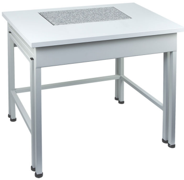
SAP/C Industrial Antivibration Table

More information on the website radwag.com/en/info,w1,9TS