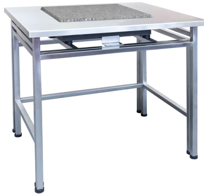
SAP/H Stainless Steel Industrial Antivibration Table

The drawings, photos and graphics used are for illustrative purposes only.