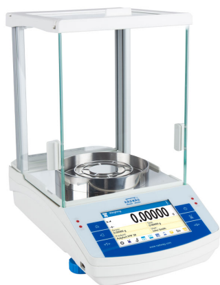
AS 60/220.X2 PLUS Analytical Balance

The drawings, photos and graphics used are for illustrative purposes only.