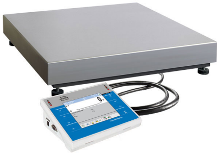
WLY 60/C2/K Precision Balance

More information on the website radwag.com/en/info,w1,78Z