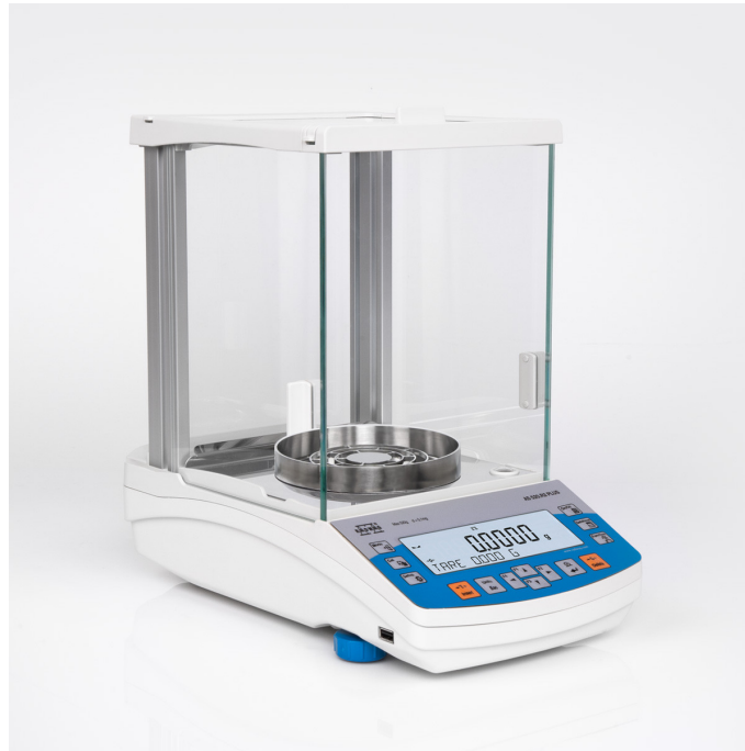
The drawings, photos and graphics used are for illustrative purposes only.