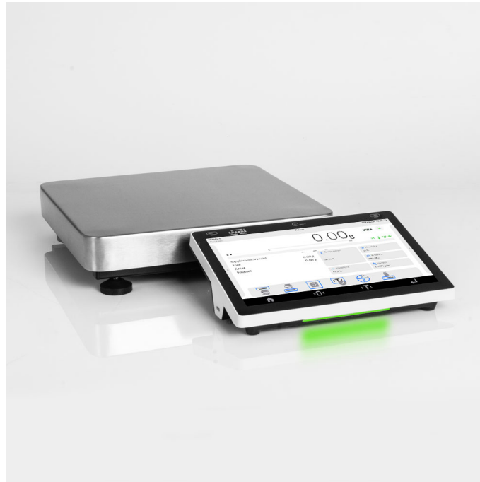
The drawings, photos and graphics used are for illustrative purposes only.