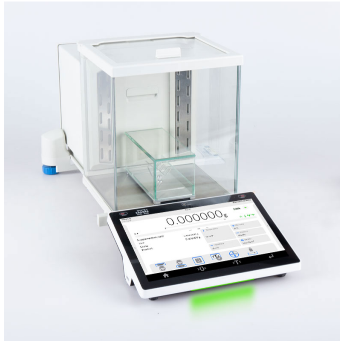
The drawings, photos and graphics used are for illustrative purposes only.