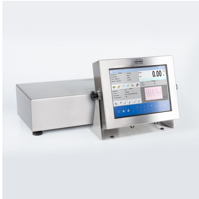
The drawings, photos and graphics used are for illustrative purposes only.

More information on the website radwag.com/us/info,w1,SC9