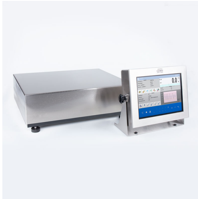
The drawings, photos and graphics used are for illustrative purposes only.

More information on the website radwag.com/en/info,w1,QWX