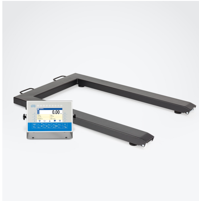
The drawings, photos and graphics used are for illustrative purposes only.

More information on the website radwag.com/en/info,w1,QV5