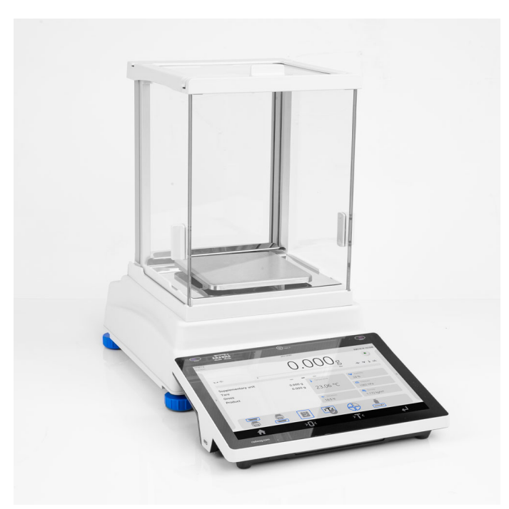
The drawings, photos and graphics used are for illustrative purposes only.