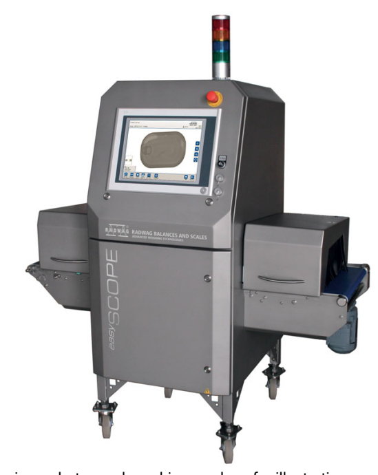
The drawings, photos and graphics used are for illustrative purposes only.