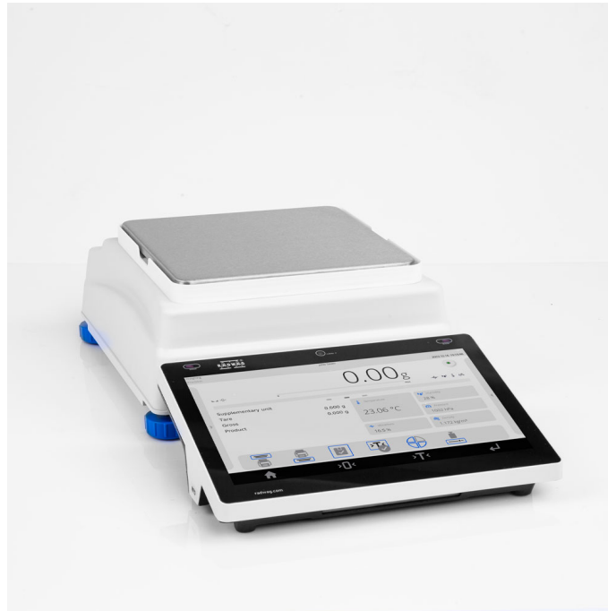
The drawings, photos and graphics used are for illustrative purposes only.