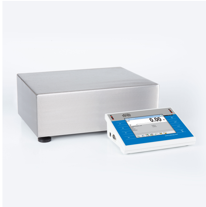
The drawings, photos and graphics used are for illustrative purposes only.