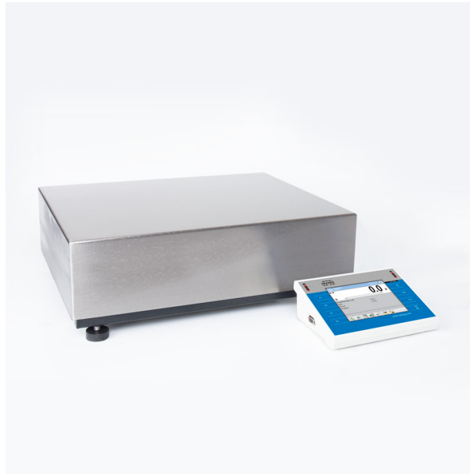
The drawings, photos and graphics used are for illustrative purposes only.